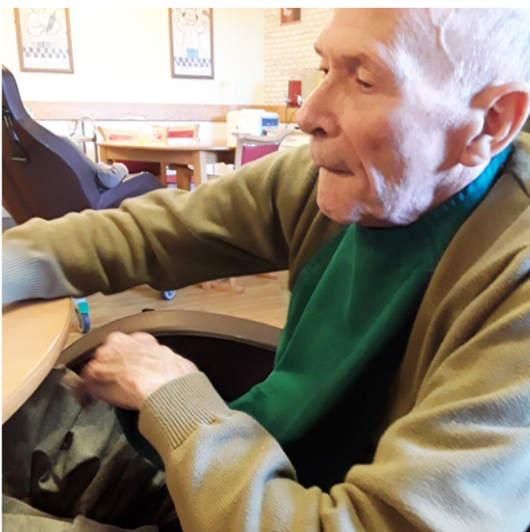
Enjoying the relaxing sensory displays