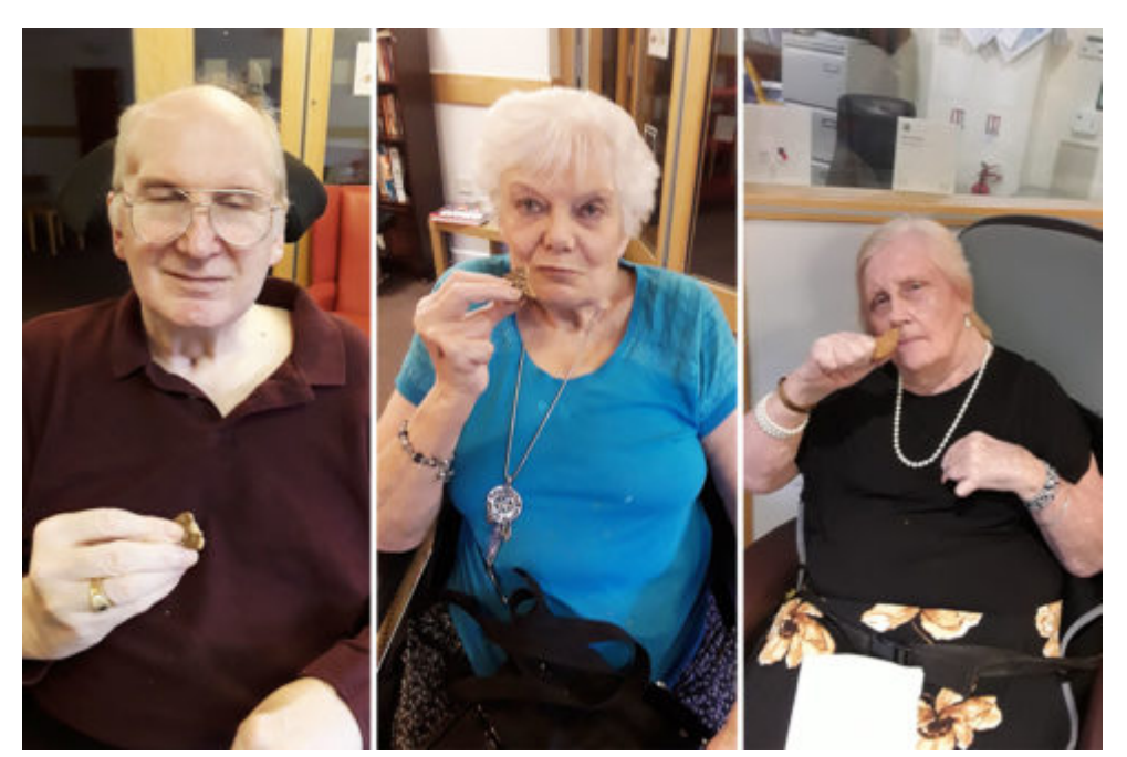
We had fun sampling the four flavours!